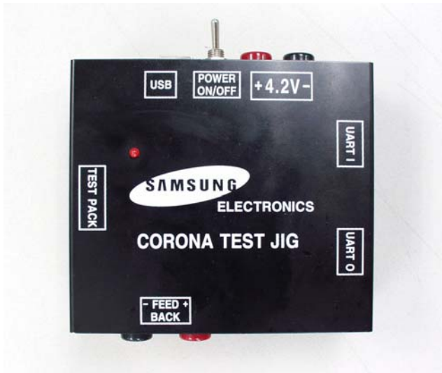
Test Jig (GH80-03306A)