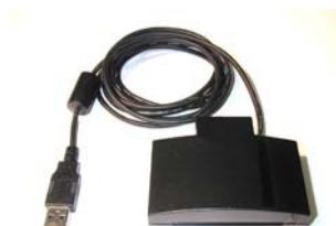
Service Card Reader