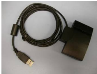
Smart Card Reader (7)